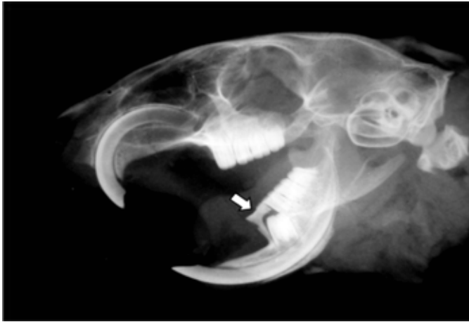
Fig.1. Lateral radiograph of the head of an agouti presenting a lower deciduous premolar (arrow) in eruption.

100 \mu m. Sections were dehydrated in alcohol, clarified in xylol and photographed under a magnifying glass (Pécora 1992).